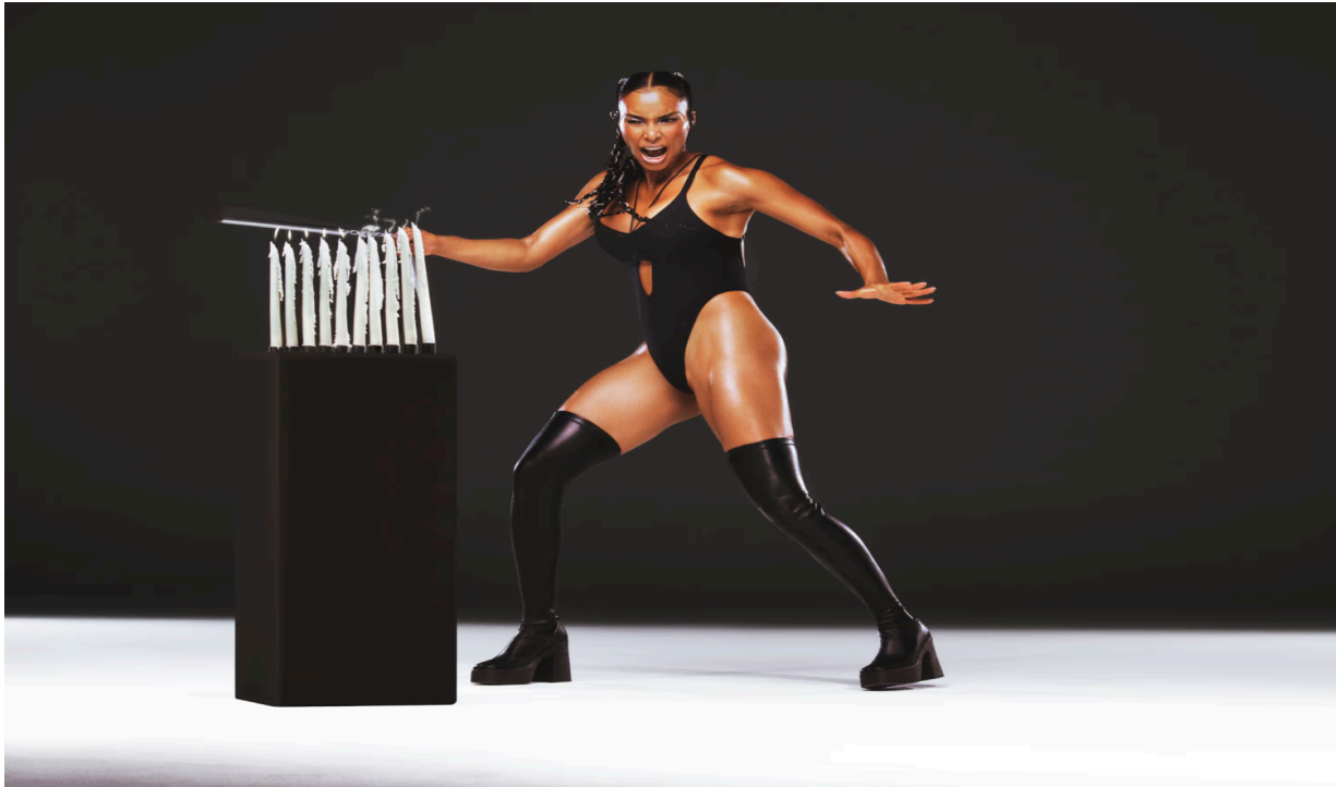
Savage X Fenty

With pieces such as Rihanna's favorite, the Peak Performance High Waist Leggings, jumpsuits, bodysuits, and low to medium-impact bras, this collection is bound to sell out quickly. Products will be available in sizes XS-4X.