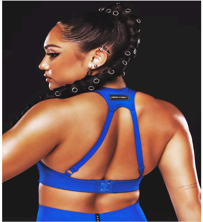
Savage X Fenty